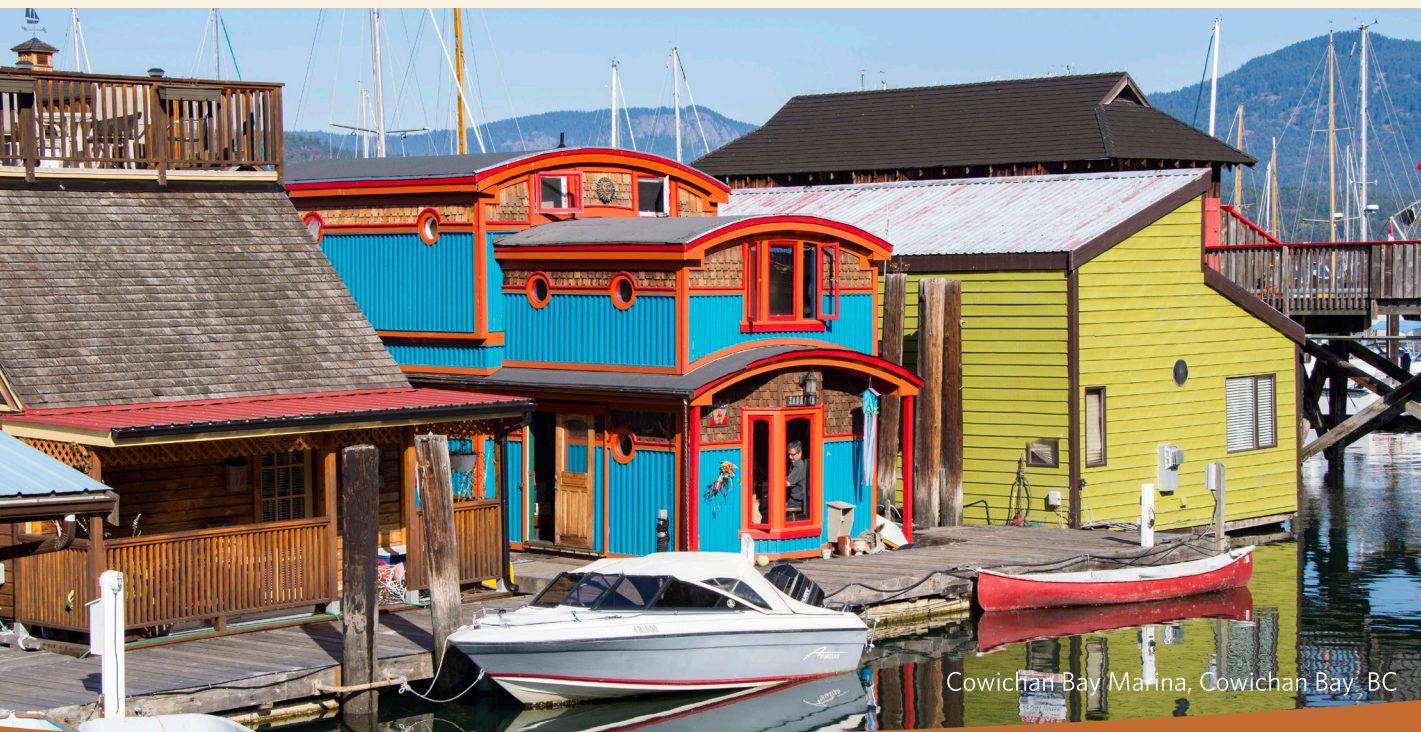
Cowichan Bay Marina, Cowichan Bay BC