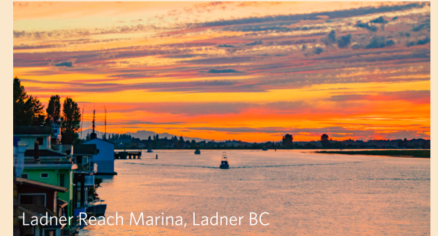
Ladner Reach Marina, Ladner BC

Floating homes are a part of the fabric of British Columbia's history and current economy. With origins in floating logging and fishing camps along the coast of the province, floating homes provide an alternative to crowded city spaces, connecting residents with a close knit community and the natural environment around them.