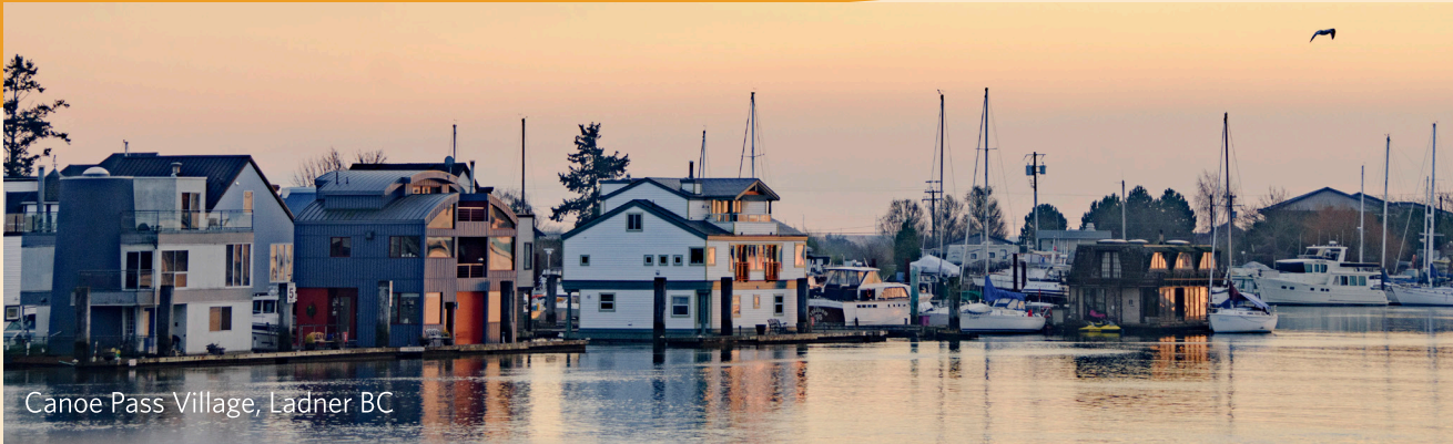
Canoe Pass Village, Ladner BC