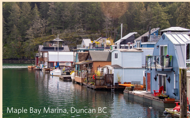
Maple Bay Marina, Duncan BC

For those seeking more information there are links to great books, magazine articles and stories about floating homes, as well as videos and an extensive photo gallery.