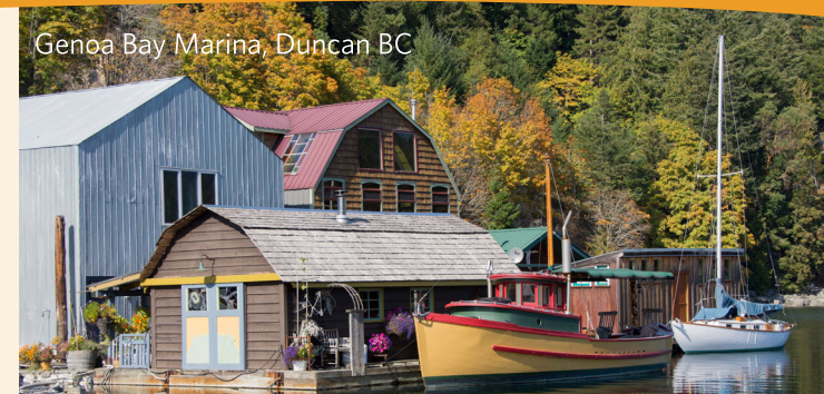
Genoa Bay Marina, Duncan BC

Imagine sitting at your front door, feet dangling in the water as you feed newly hatched goslings, cygnets and ducklings. Lulled by the gentle splash of waves, cheered by the laughter of ducks, jolted by the bark of a seal, or haunted by the lonesome cry of an eagle—life on the water is a kaleidoscope of the sights and sounds of nature.