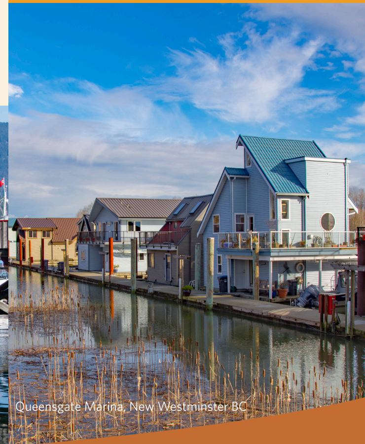
Queensgate Marina, New Westminster BC